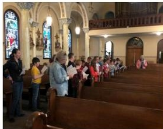
St. Boniface—Stuart 3rd—6th Grades Stations of the Cross and Rosary