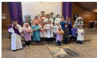
Living Stations @ St. Mary's—Spencer